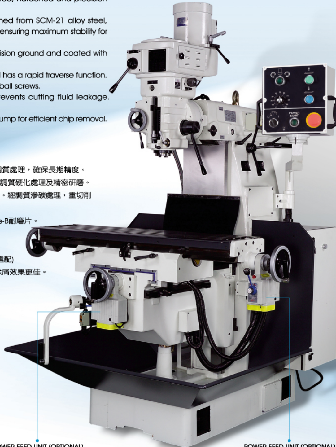
POWER FEED UNIT (OPTIONAL) 自動進給裝置 (特別附件)